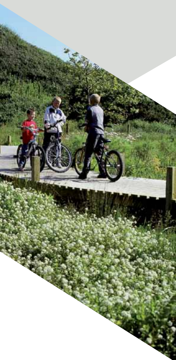
Trelloggan Community Project, Trelloggan, Cornwall

‘Different communication strategies will be needed at different stages of an asset transfer project’