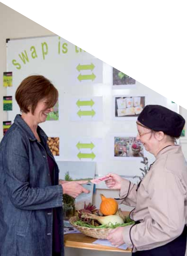
Bayley Hall Café, Hyde Park Manchester