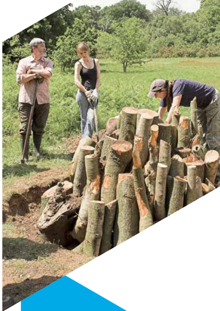
Langley Park Country Park, Buckinghamshire

Check how your various asset transfer options could affect your other policies, for instance on climate change adaptation, flooding, transport, access, health, culture and education.