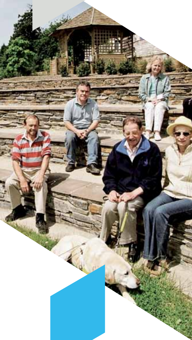
St Neot Doorstep Green, Liskeard, Cornwall

Community groups will need to have access to the specific skills necessary to manage a public space, within the group, through a partnership or by buying particular services. They will need green space skills like horticulture, ecology, landscape design and management, as well as management skills like community development, fundraising, communications, event management, budgetary control, personnel management, contract management and partnership working. It is particularly important that there is at least one person on a board of trustees with experience of open space management. Some organisations, such as Groundwork, run horticultural training schemes for the long-term unemployed and there may be opportunities to link with programmes like this, or set up similar schemes to develop the skills of local people on site.